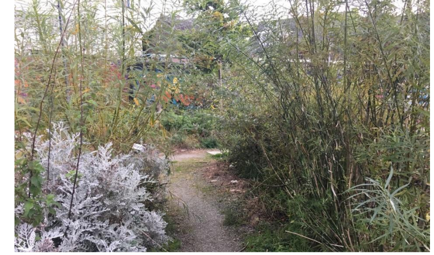
New Street Garden Waterford