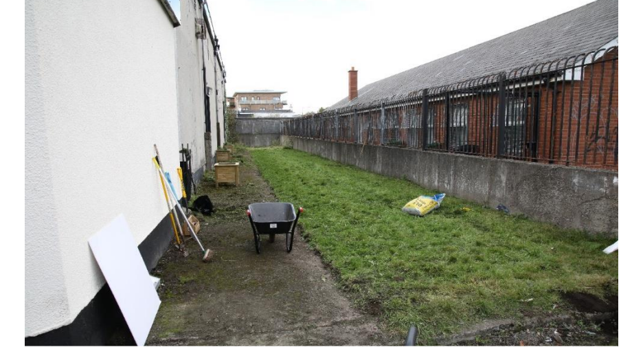
St Michael's Community Centre, Inchicore