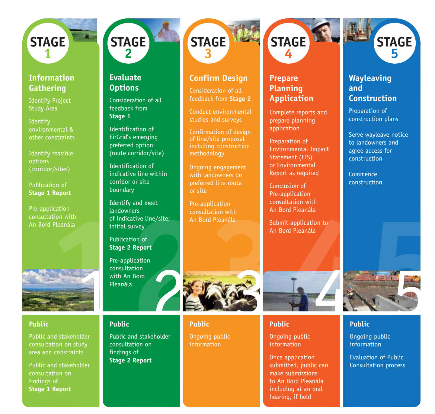
Figure 1. The EirGrid Roadmap